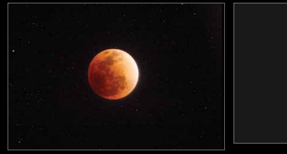
Lunar Eclipse With Stars Roger Groom