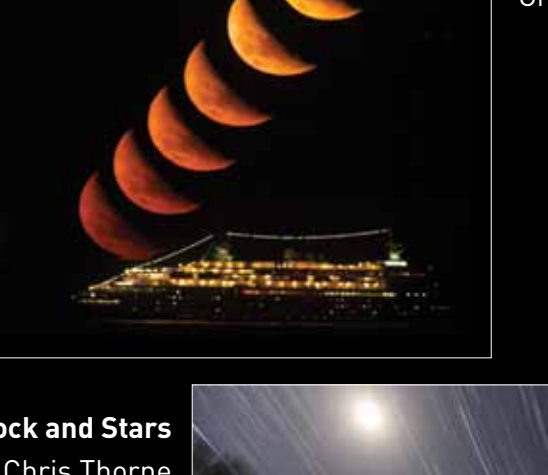
Moonset and Ship