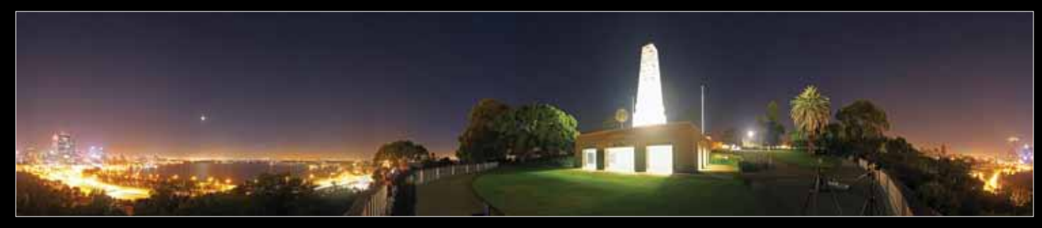
360 degree view of Comet Lovejoy from Kings Park, Perth