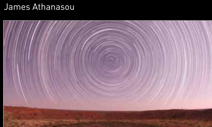
Wolfe Creek Crater Star Trails