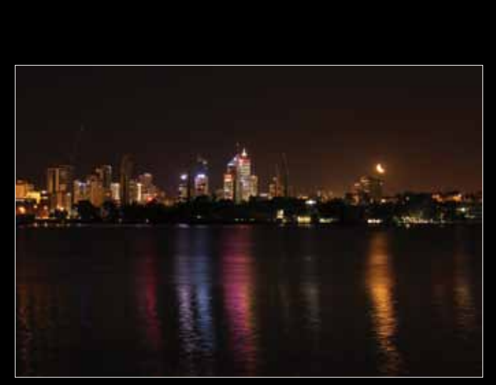
Moon and City Skyline Divya Palaniswamy