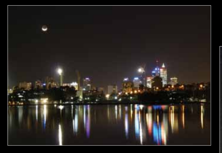
Perth Skyline and Moon