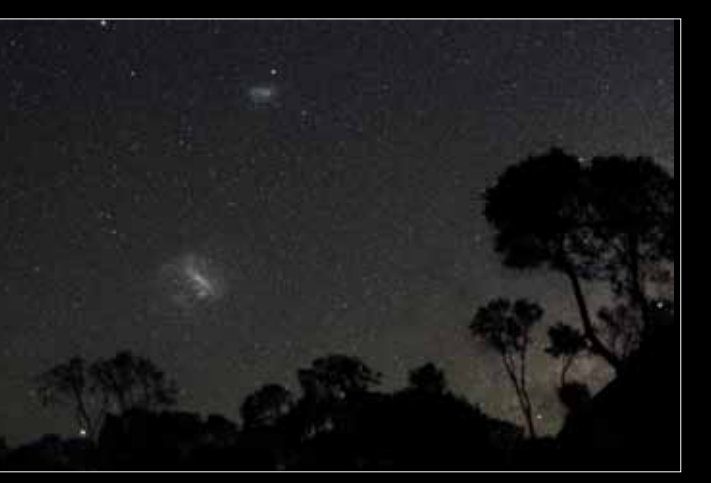
Large and Small Magellanic Clouds Roger Groom