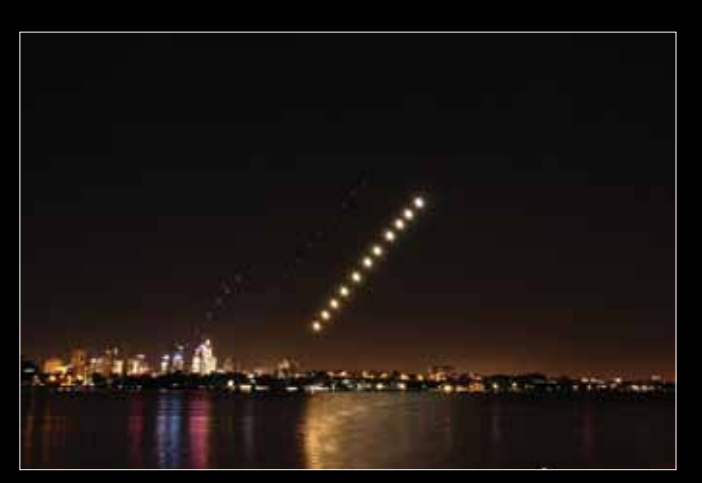
Perth, Planets and Moon Divya Palaniswamy